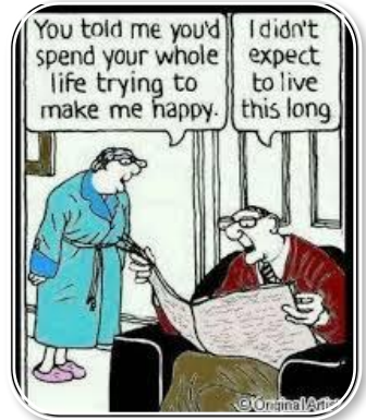
Picture below, a Lenten challenge perhaps to avoid the picture above?