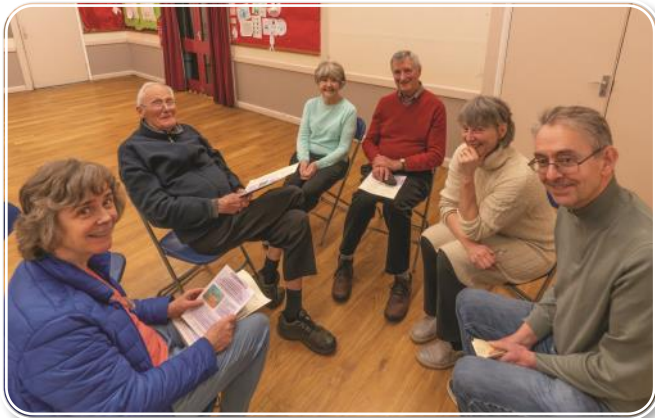
Mixed Teams meetings