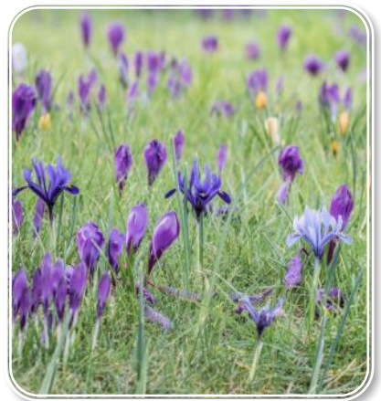
Our front lawn

Front cover. The Holy Spirit from Celebrate Conference.