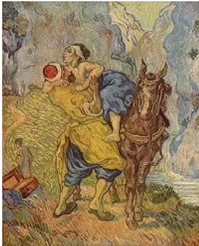
The Good Samaritan – Van Gogh, 1890