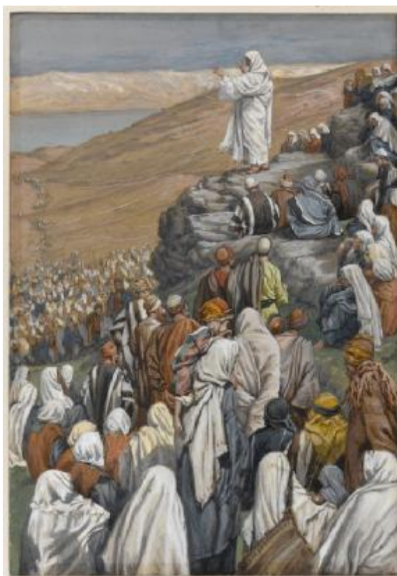
The Beatitudes Sermon – James Tissot – 20th century