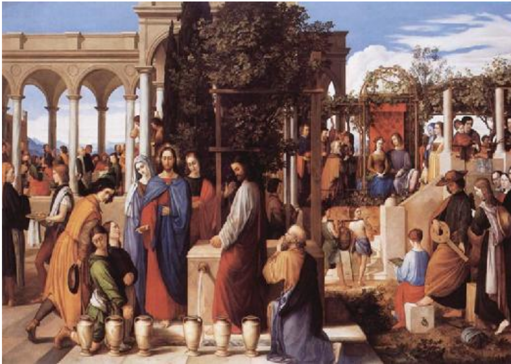
Wedding feast at Cana – Julius Schnorr von Carolsfeld, 1820