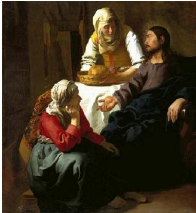
Jesus with Martha and Mary – Vermeer, 1654