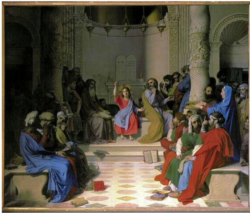
Jesus among the doctors – Ingres, 1862