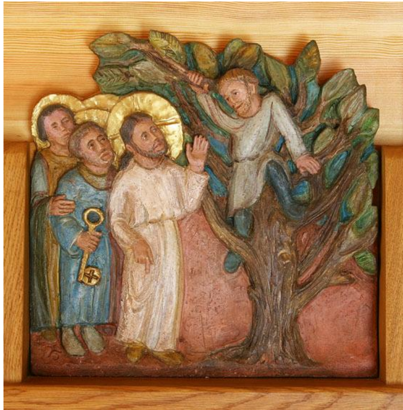
Jesus and Zacchaeus– Sister Mercedes, 2006, Notre-Dame des Neiges, France